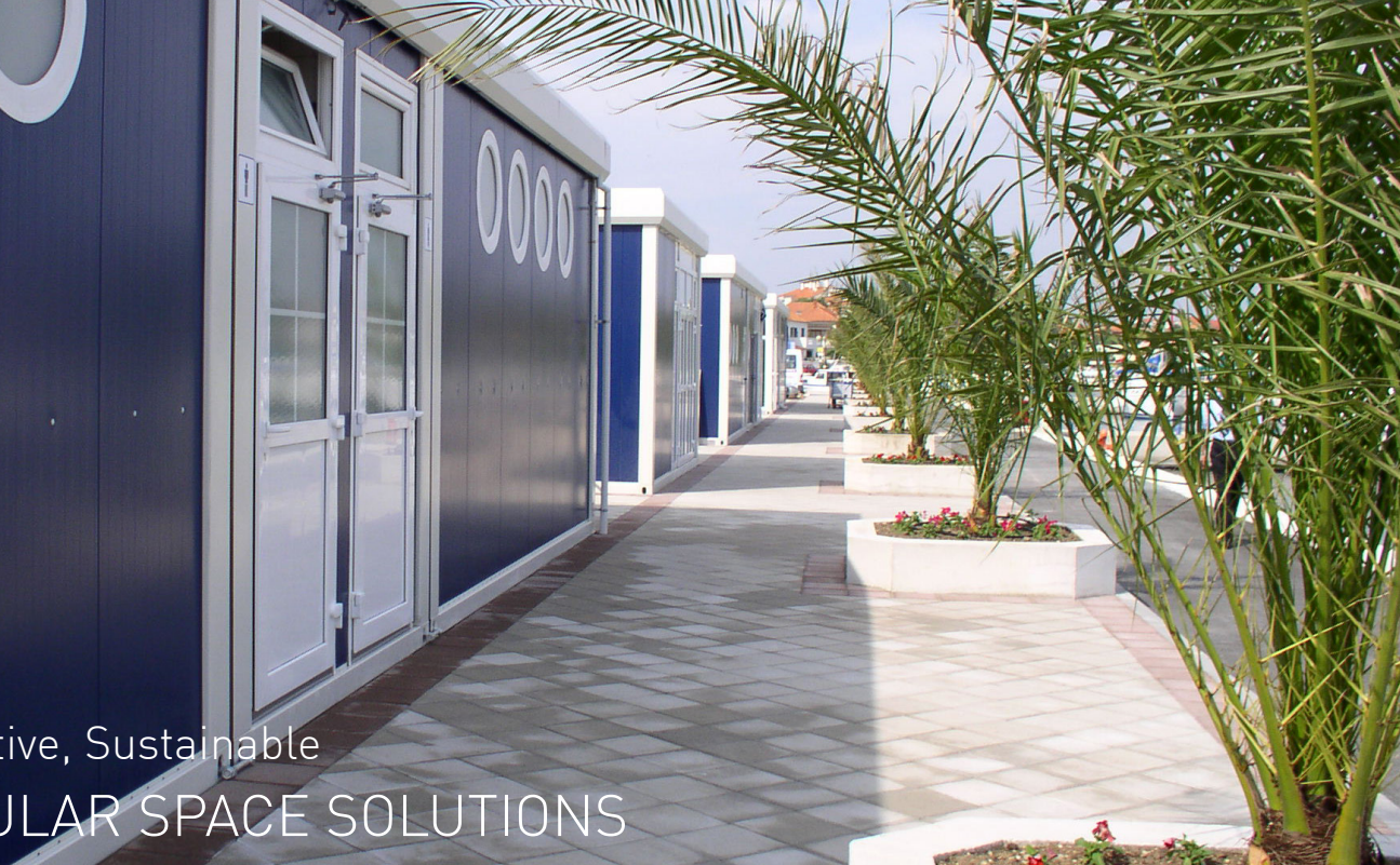
Sanitary Block and Shop, Marina Kornati, Biograd na moru, Croatia