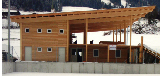
Sports Facility, Alpbach, Austria