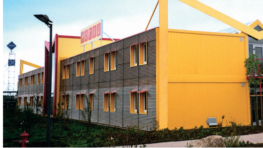
Motel Pelikan, Dettelbach, Germany