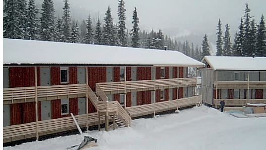
Hotel, Hemsedal, Norway