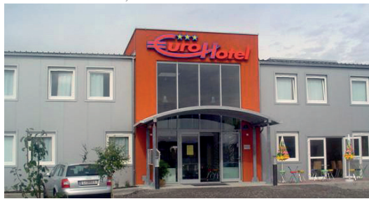
Eurohotel, Pettenbach, Austria